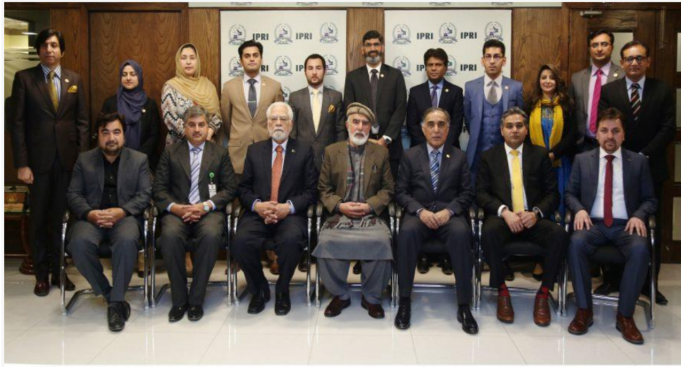
ISLAMABAD, FEB 28: Participants pose for a picture on the eve of National Dialogue