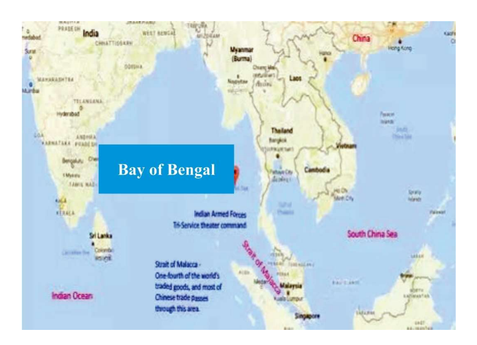
Annex-3 Andaman and Nicobar Islands