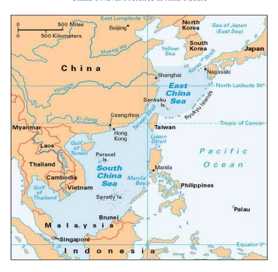
Annex-4 China's Naval Presence in Asia-Pacific