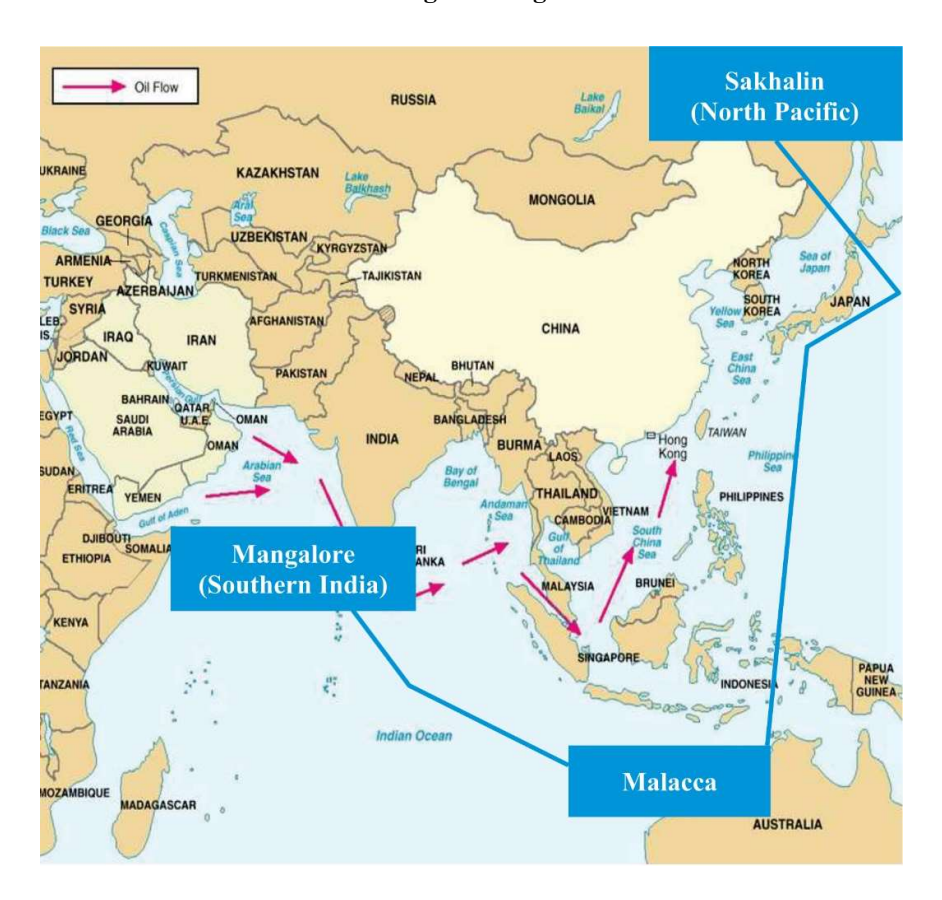
Annex-2 India's Trade Passages through Malacca Straits